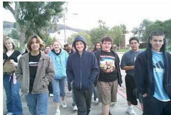
Touring Cal Poly SLO

Second 45 minutes: Developing college-level skills in writing, inquiry, collaboration, reading; University and scholarship research; Financial Aid help; Preparing for SAT, ACT exams, Resume Preparation.