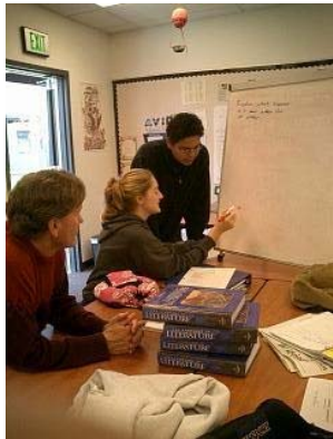
Tutoring in AVID by College Tutors or Peers

AVID functions to ensure that the enrolled student will succeed in a rigorous curriculum, enter the mainstream activities of the school, and become an educated and responsible participant and leader in a democratic society, all the while preparing for college.