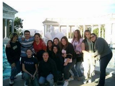
Hearst Castle Trip

lunch to discuss field trips and fundraising.