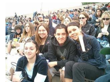
Attending UCLA Football Game

* AVID Students will be expected to exceed these A-G requirements. Students will be required to take extra years in courses marked with a (*). Students must attempt at least one Advanced-Placement or honors class.